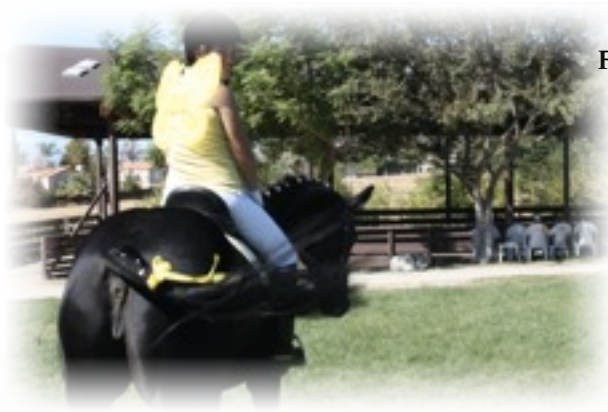
Float like a butterfly...